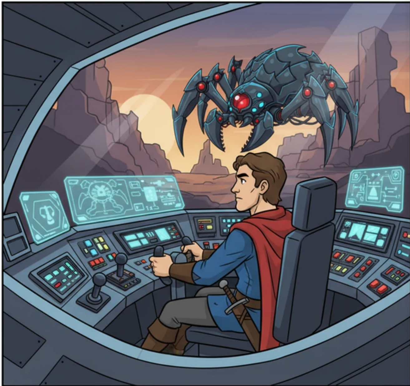
ARY - THE ORDINARY PILOT vs. THE IRON SCORPION

Ary sits inside the futuristic cockpit, his hands hovering over holographic controls that respond to his thoughts. He feels the immense strength of the robot flowing through him, creating a perfect bond between man and machine.