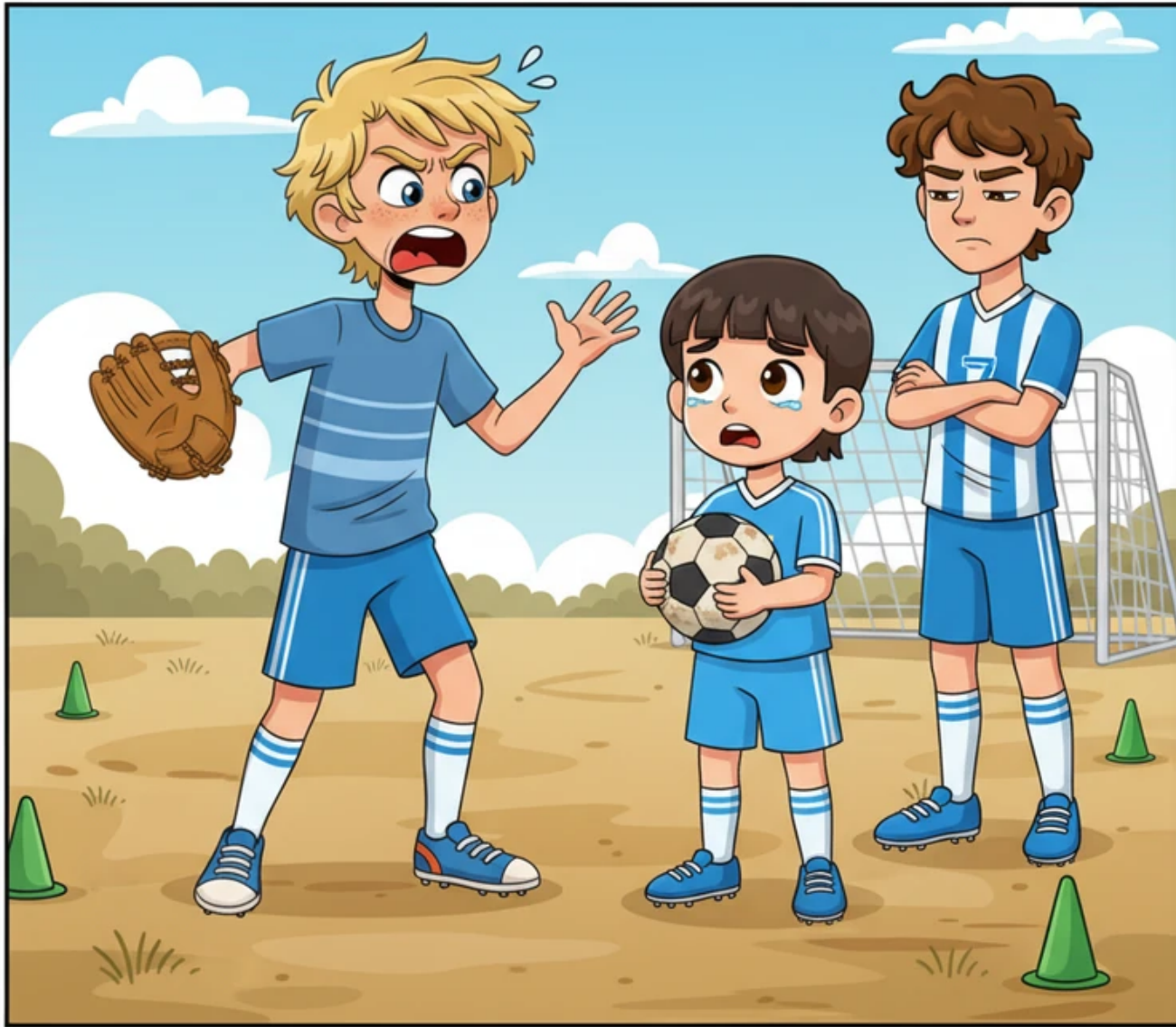
The Case of the Flat Ball

The team struggled to work together at first, making messy mistakes and failing to score during their practice matches. Some of the boys looked upset and discouraged, kicking the dirt in disappointment as they realized that winning would be much harder than they thought.