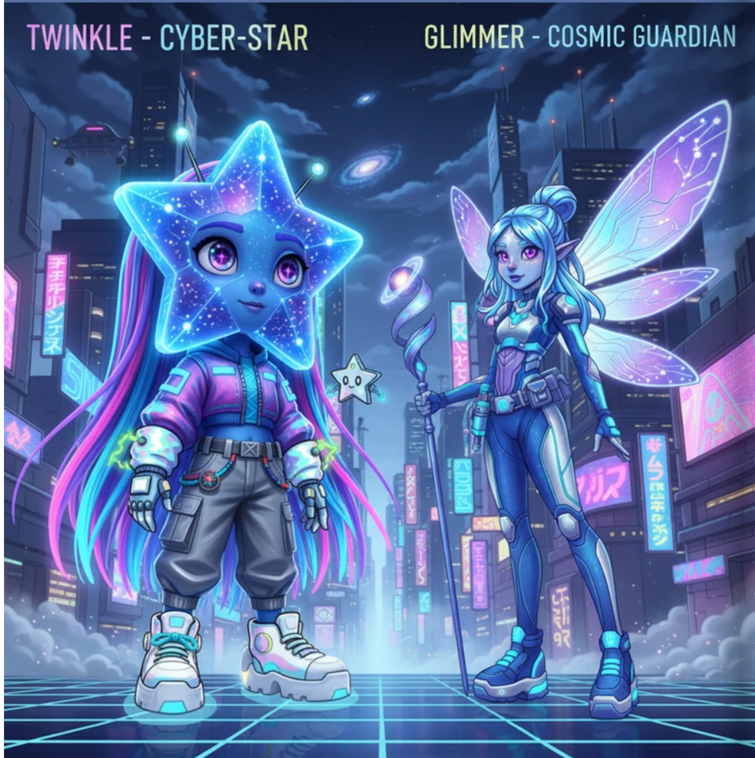
GLIMMER - COSMIC GUARDIAN

Twinkle and Glimmer are greeted by the Rainbowlings, tiny creatures with translucent wings and bodies that change color based on their happiness. The friendly inhabitants welcome the travelers to their garden of light with joyful chirps and playful dances.