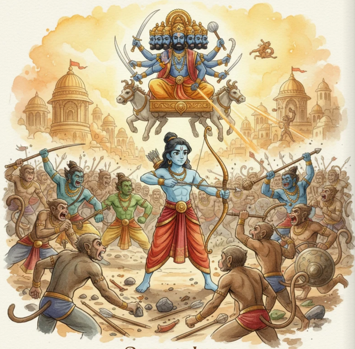
BATTLE OF LANKA

A great battle began between Rama's army and Ravana's forces under the bright sun. With a final, powerful arrow of light, Rama defeated the demon king and proved that goodness and truth always win in the end.