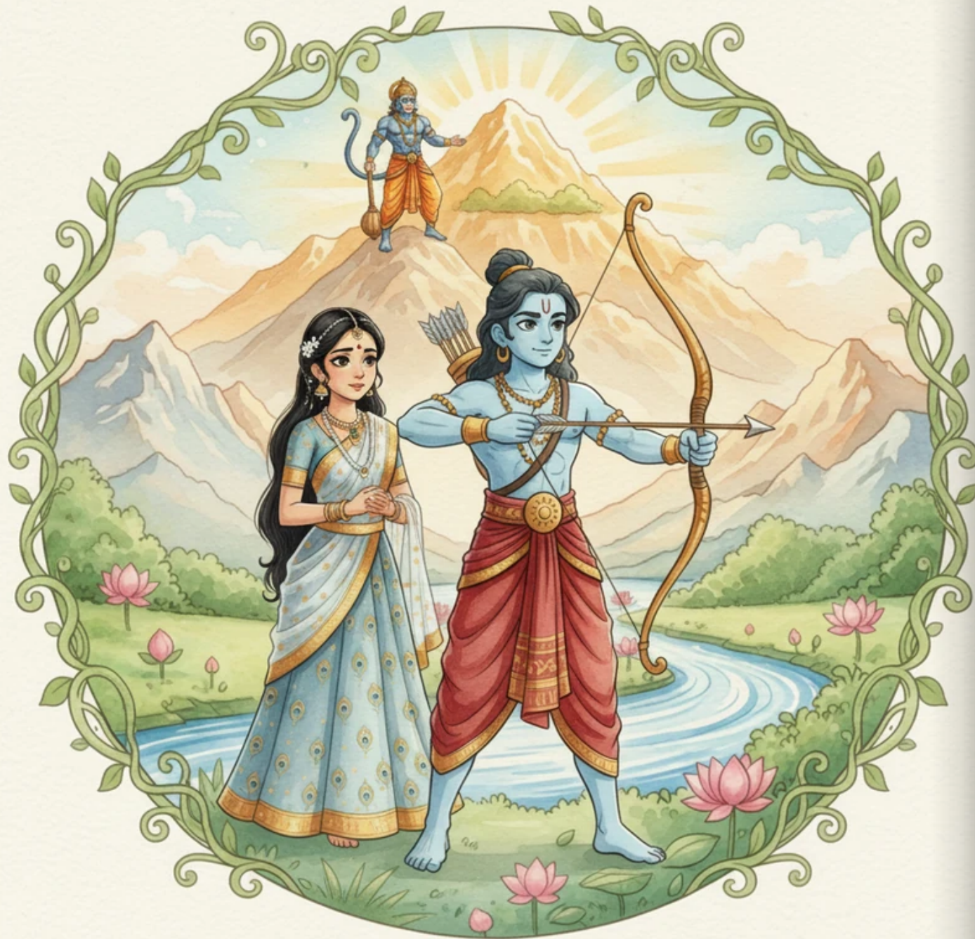
THE SANJEEVANI MOMENT

Searching for Sita, Rama met the powerful monkey hero Hanuman and the monkey king Sugriva. Hanuman jumped across the vast ocean to find Sita and promised that Rama's army would soon come to save her.