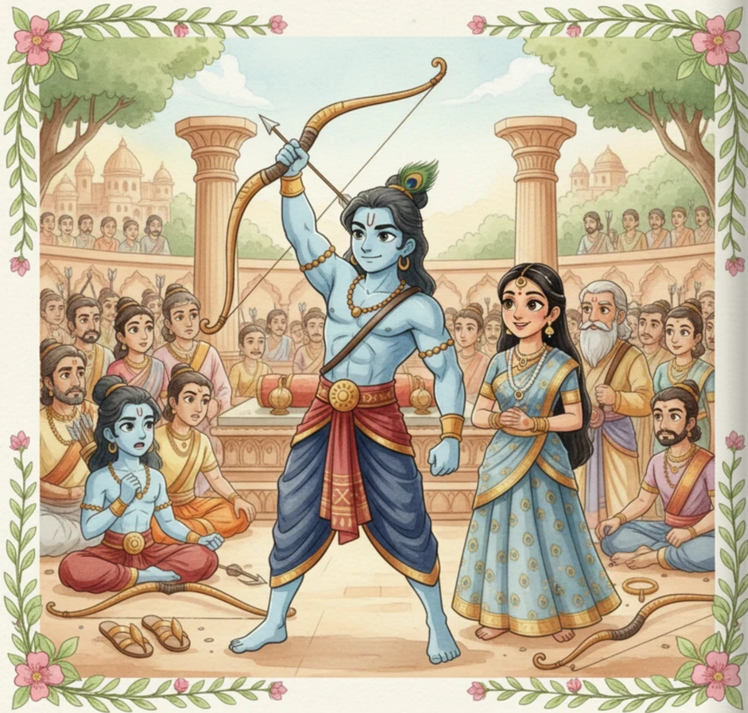
THE BREAKING OF THE BOW - SITA'S SWAYAMVARA

In the kingdom of Mithila, Rama stood before a giant, heavy bow that belonged to Lord Shiva. With effortless strength, he lifted the bow and snapped it in two, winning the hand of the beautiful Princess Sita in marriage.