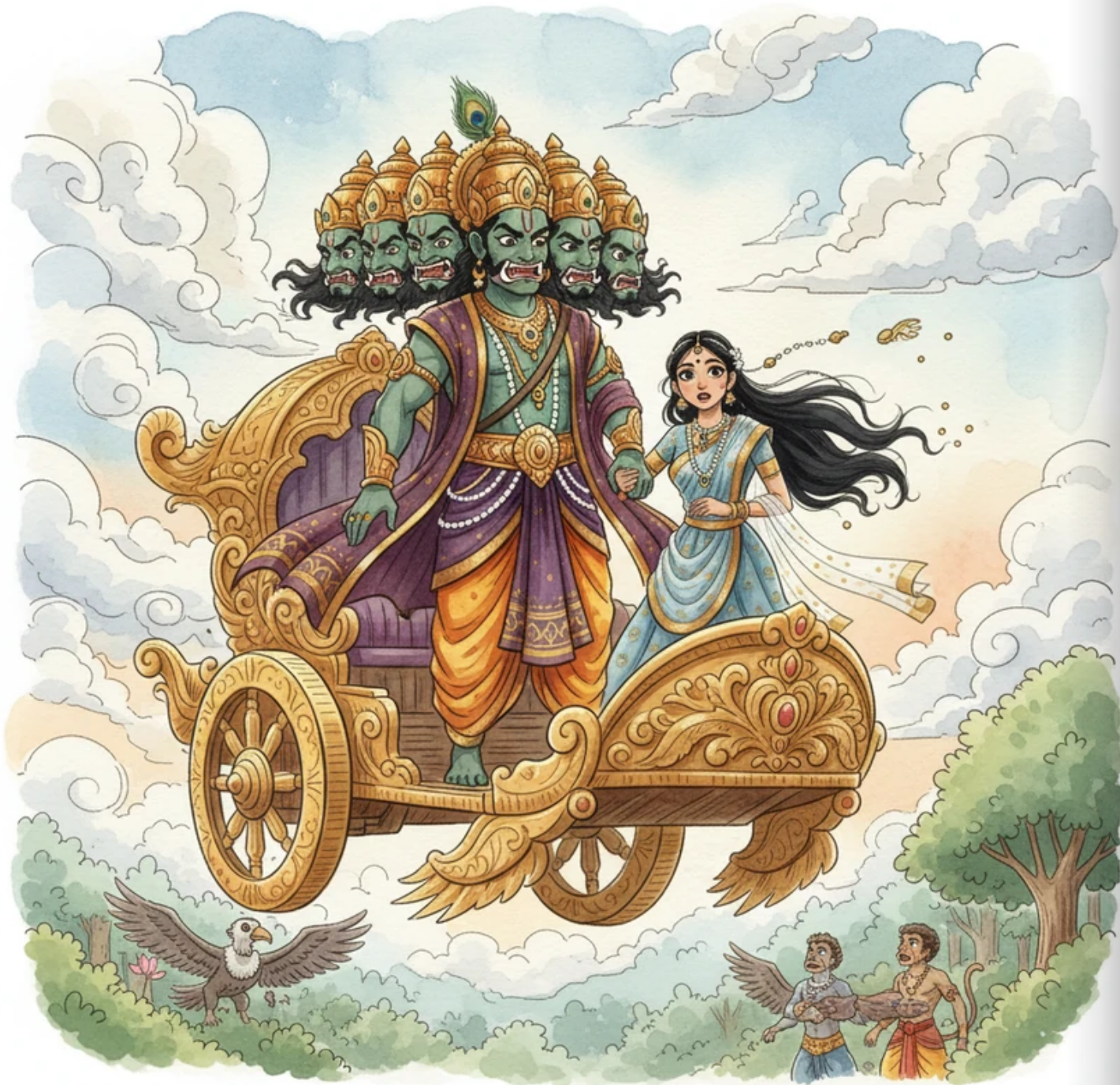
THE KIDKAPPING OF SITA

While Rama was gone, the ten-headed demon king Ravana arrived in a flying chariot and took Sita away to his island kingdom of Lanka. Sita dropped her jewelry along the way, hoping Rama would find the trail and rescue her.