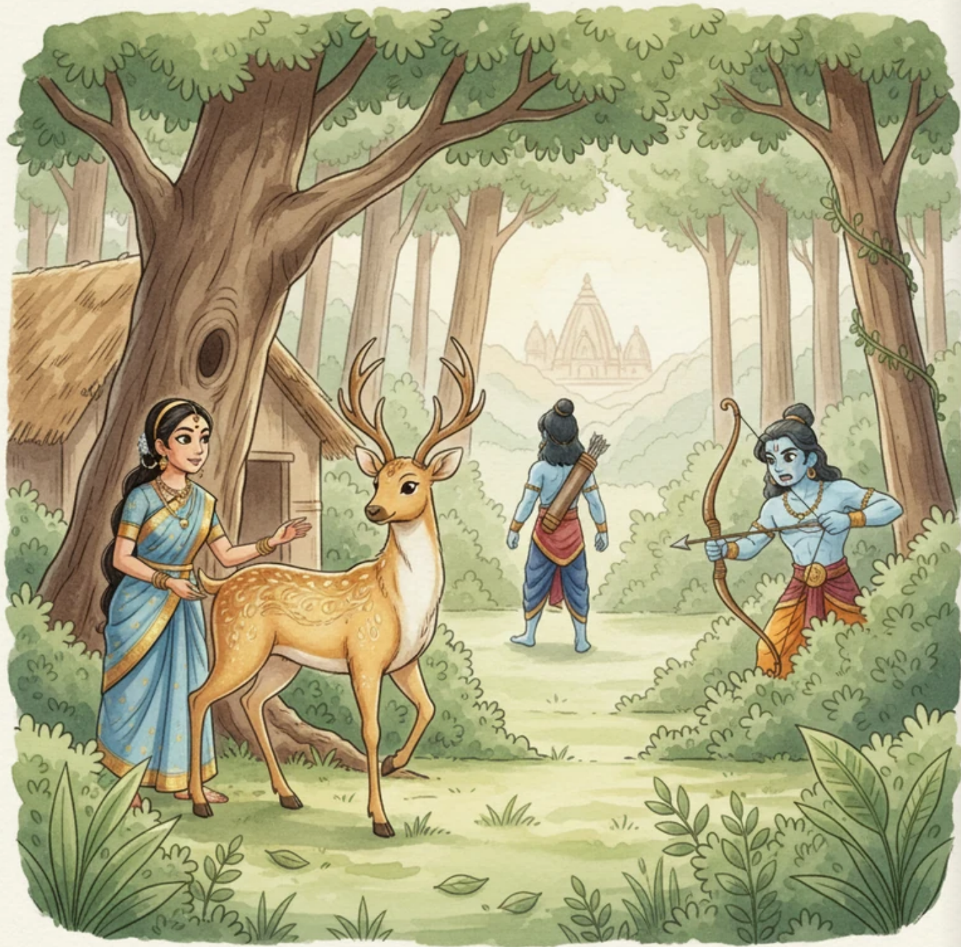
THE ENCHANTED DEER

One day, a shimmering golden deer appeared near their forest hut, sparking Sita's curiosity. Rama chased the magical creature deep into the woods, not knowing it was a clever trick to draw him away from their home.