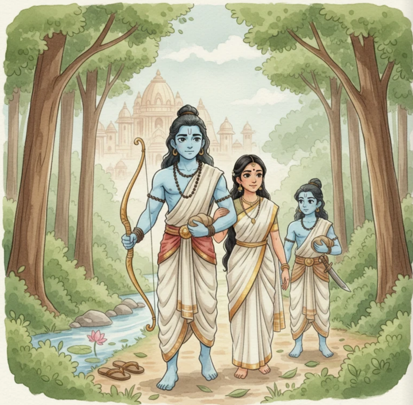
THE EXILE BEGINS

To keep a promise made by his father, Rama dressed in simple clothes and prepared to live in the forest for fourteen years. He was joined by his devoted wife Sita and his loyal brother Lakshmana, who walked beside him into the green wilderness.