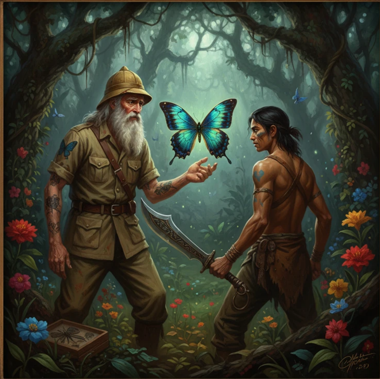
The Collector's Remorse

Barnaby took off his leaf wings and realized that he didn't need to be small to be special. He was a Butterfly Elephant, big enough to help everyone and gentle enough to love the smallest friends in the jungle.