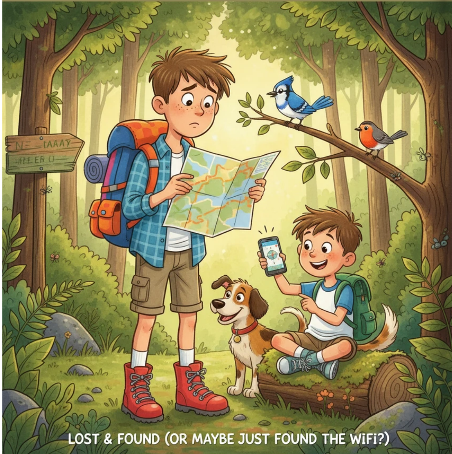
LOST & FOUND (OR MAYBE JUST FOUND THE WiFi?)

As they continue their trek, they accidentally startle a ginger cat sitting on a stone wall. The cat hisses and leaps away, leaving the two muddy brothers looking very confused.