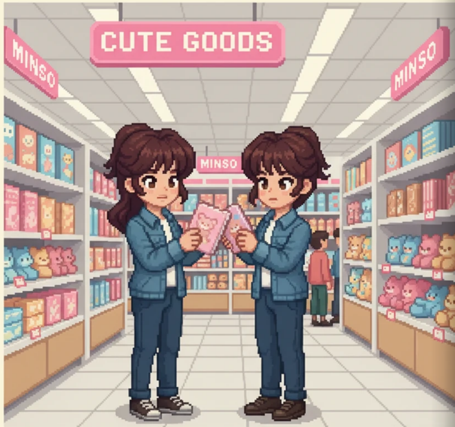
A CHANCE ENCOUNTER AT MINISO

It all began with a fleeting moment of eye contact in a Miniso store that sparked an unexpected connection deep within. Soon, fate brought them together in the same tuition classes, weaving their lives into a single golden thread as two strangers stepped into a journey of destiny.