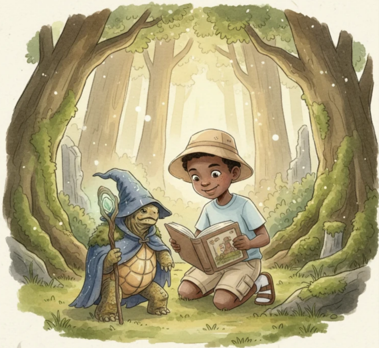
Thabo and Titus - A Storyteller's Friendship

The two friends take a break at a small wooden table to enjoy some tasty treats. They sip warm rooibos tea from tin mugs while listening to the birds chirp in the trees.