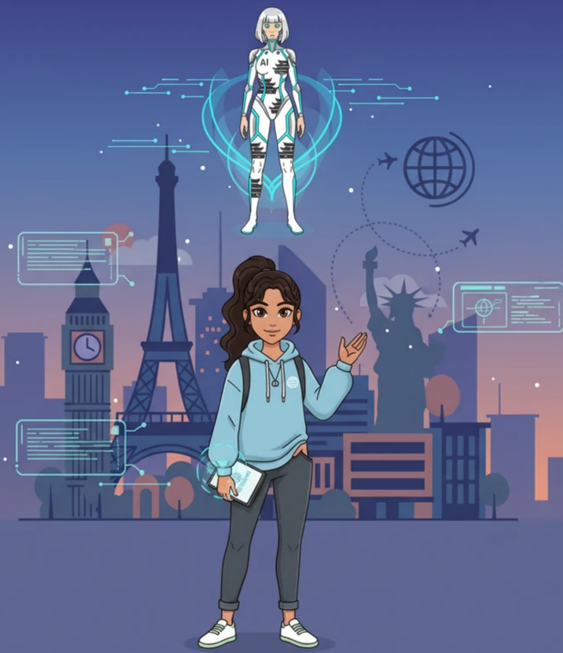
ELENA - SPARK OF CONSUMPTION

She stops to sketch the iconic Horse-head walls, noting how they rise like elegant steps against the gray sky to protect the wooden homes from fire. These architectural symbols represent the pride and history of the families who built them centuries ago.