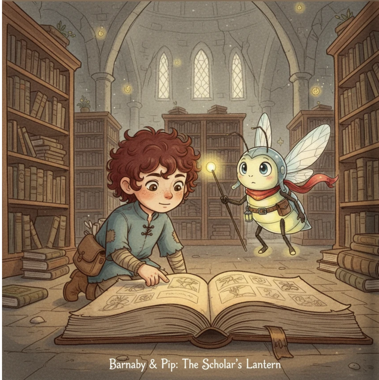
Barnaby &amp; Pip: The Scholar's Lantern

Barnaby lived in a cozy teapot house nestled under the roots of a giant, ancient oak tree. He was as curious as a cat and always kept his long ears perked for the rustle of a new story blowing in on the breeze.