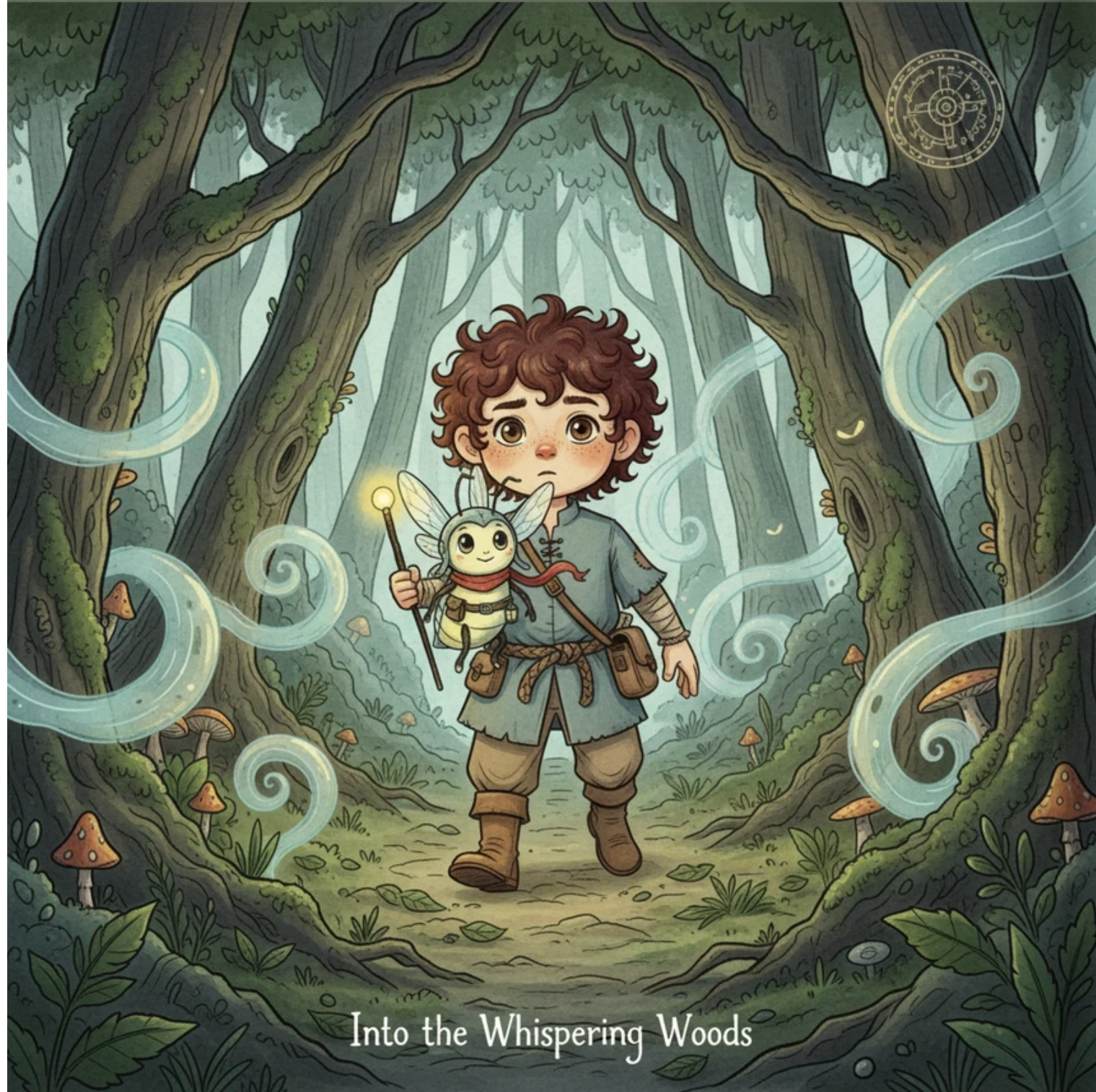
Into the Whispering Woods

The Whispering Woods were thick with trees that hummed like a choir of bees in the afternoon sun. The wind was a silver flute, playing a gentle melody that guided Barnaby deeper into the emerald shadows and dancing leaves.