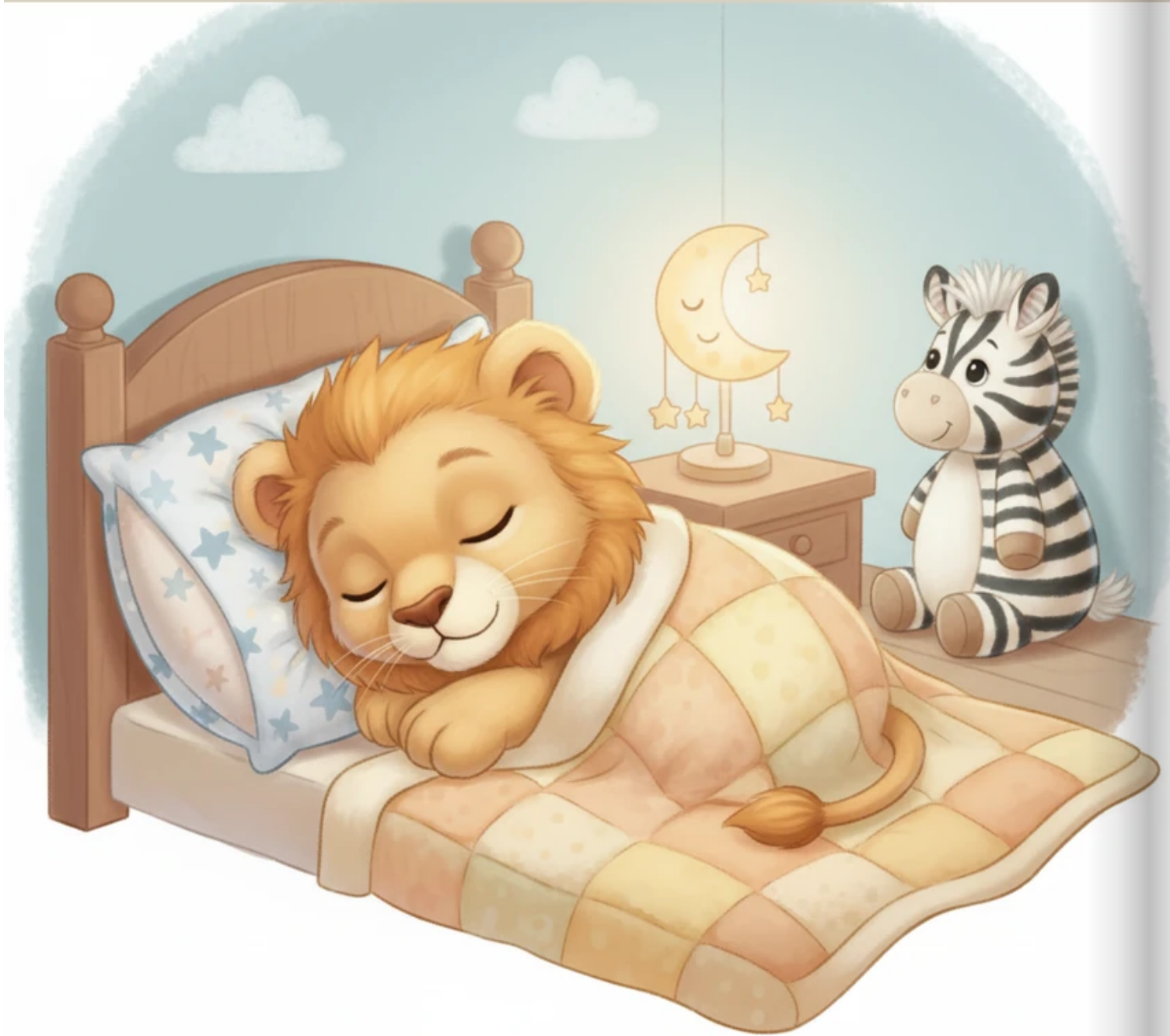
Leo's Peaceful Slumber

Leo feels very full and very sleepy, so he curls up for a long nap in the dirt. The warm wind whistles a soft lullaby through the leafy acacia trees.