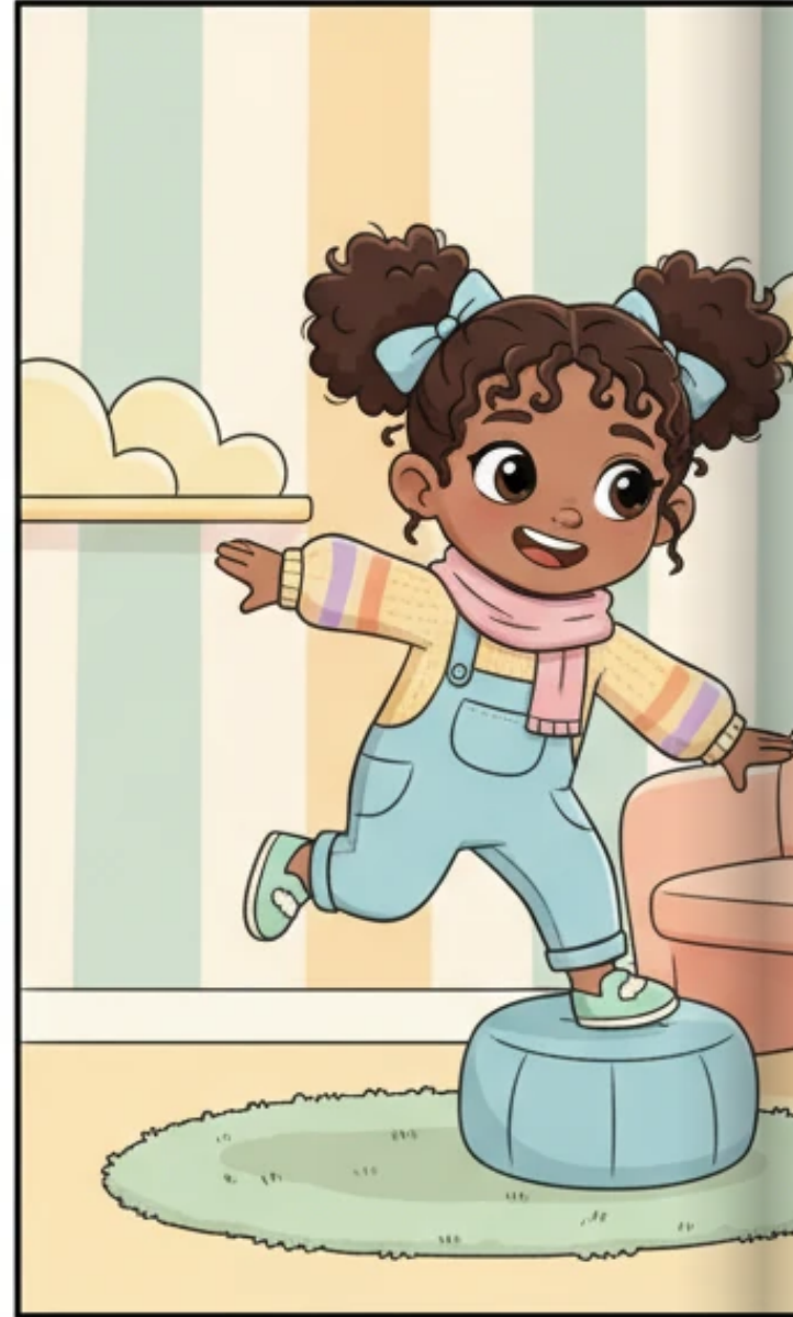
...promising a new beginning

A gentle light now fills the space, subtly transforming the mood. Walls are painted in soft, warm pastel tones, and hints of low, rounded furniture begin to appear, promising a new beginning.