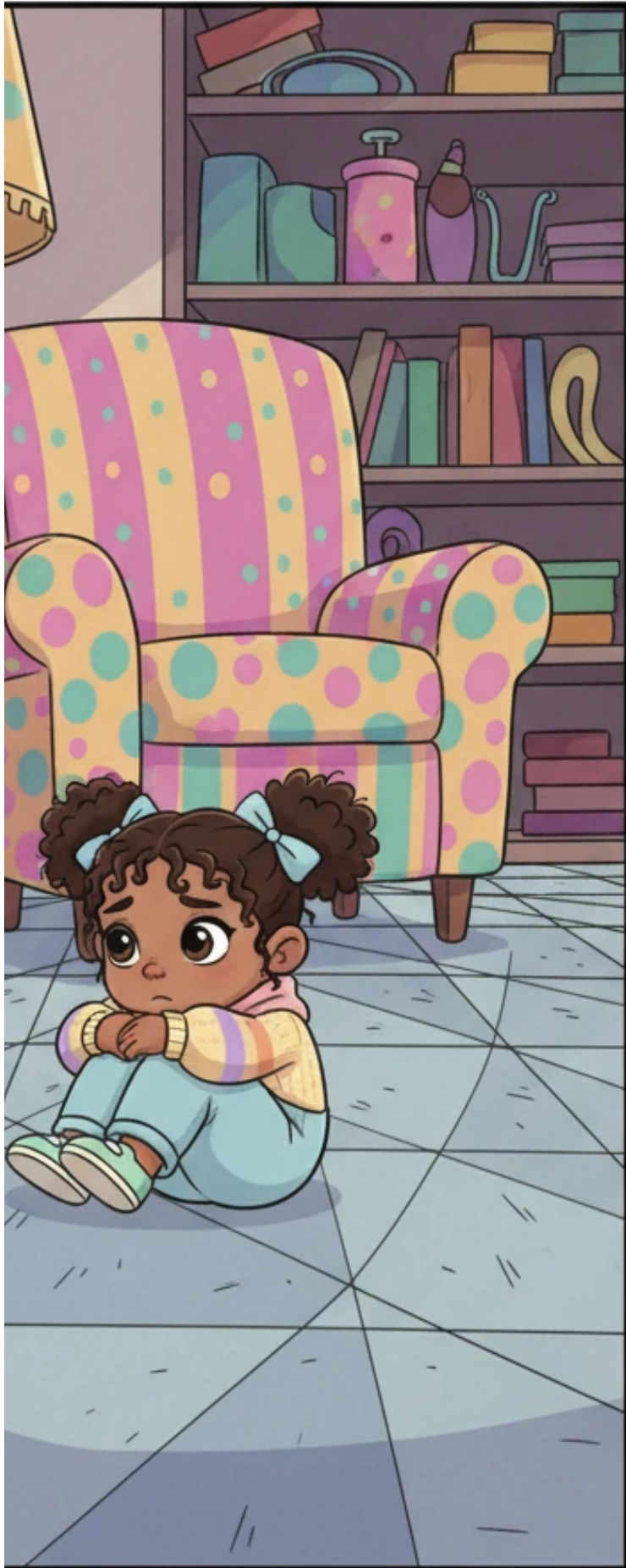
figure in a room too big.