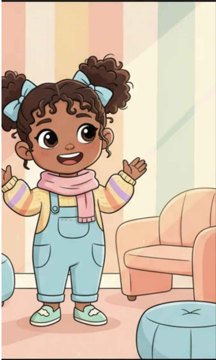
gentle light filled the space...