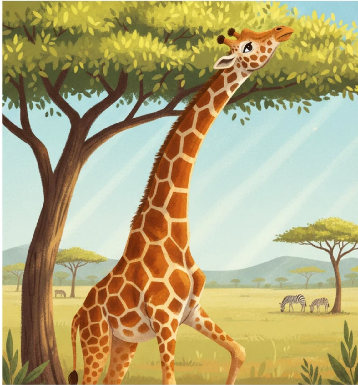
THE TALL REACH

A tall Giraffe reaches its long neck toward the top of a leafy tree under a simple sun and fluffy clouds. The name Giraffe is written below with the fun fact that a giraffe's neck is too short to reach the ground, so it has to spread its legs to drink.