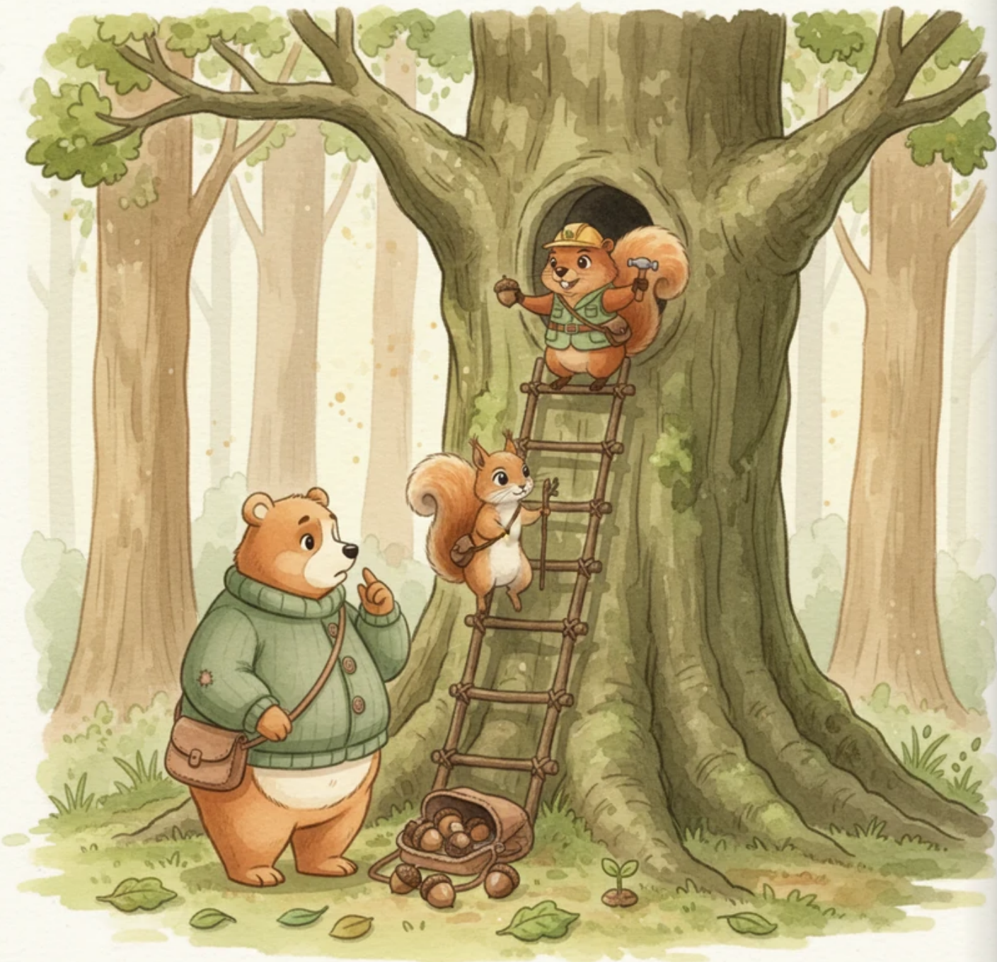
The Unexpected Exchange

He soon met Pip the Squirrel, who was leaping from branch to branch with a bundle of acorns. Pip zoomed down to help, his bushy tail twitching with excitement as they looked for clues among the ancient trees.