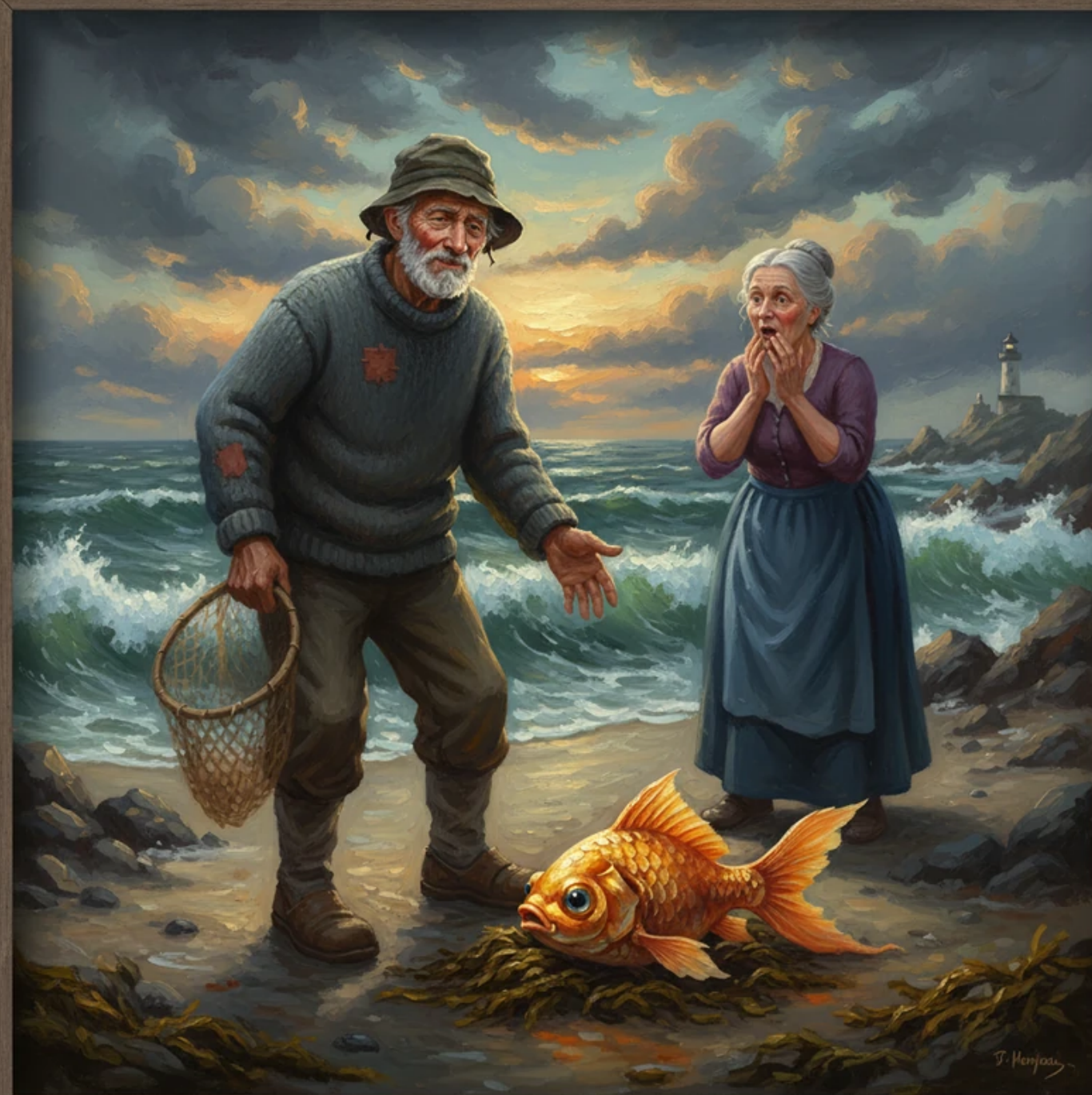
• THE FISHERMAN'S CHOICE •

Soon, a new trough is not enough, and the wife demands a large, sturdy house with a tiled roof and a garden. The fisherman calls to the fish again, and he returns to find a beautiful new home standing where their old shack used to be.