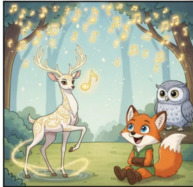
The Symphony of the Silver Woods was about to begin...

A rustic wooden sign hanging from an ancient oak tree clearly displays the title The Symphony of the Silver Woods in elegant, vine-like lettering. Oliver, a small owl with soft grey feathers and large amber eyes, perches nearby, looking curiously at a glowing musical note floating in the air.