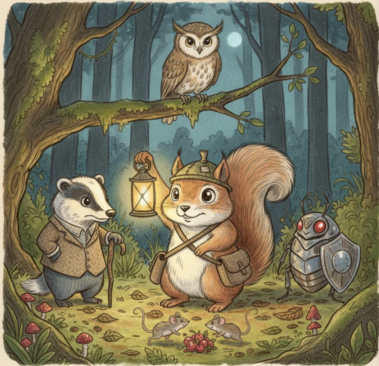
The Path Less Taken

He explained to the worried rabbits and birds that by looking at the patterns of the past, he could see an invisible thread leading into the future. He showed them how the amount of sun and rain from months ago decided exactly where the nuts would be hiding today.