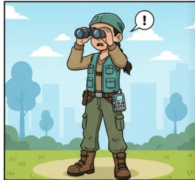
Panel 2: Investigation