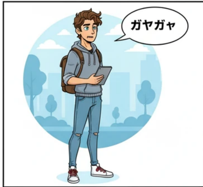
Panel 1: Noisy Disruption