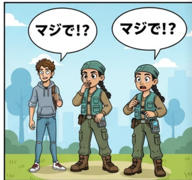
Panel 4: United Front (and Surprise)

Léo sits in his dark room, the green glow of an ancient computer screen reflecting in his glasses. He has just stumbled upon a hidden directory containing a mysterious file named Project Aurora that seems to pulse with its own rhythm.