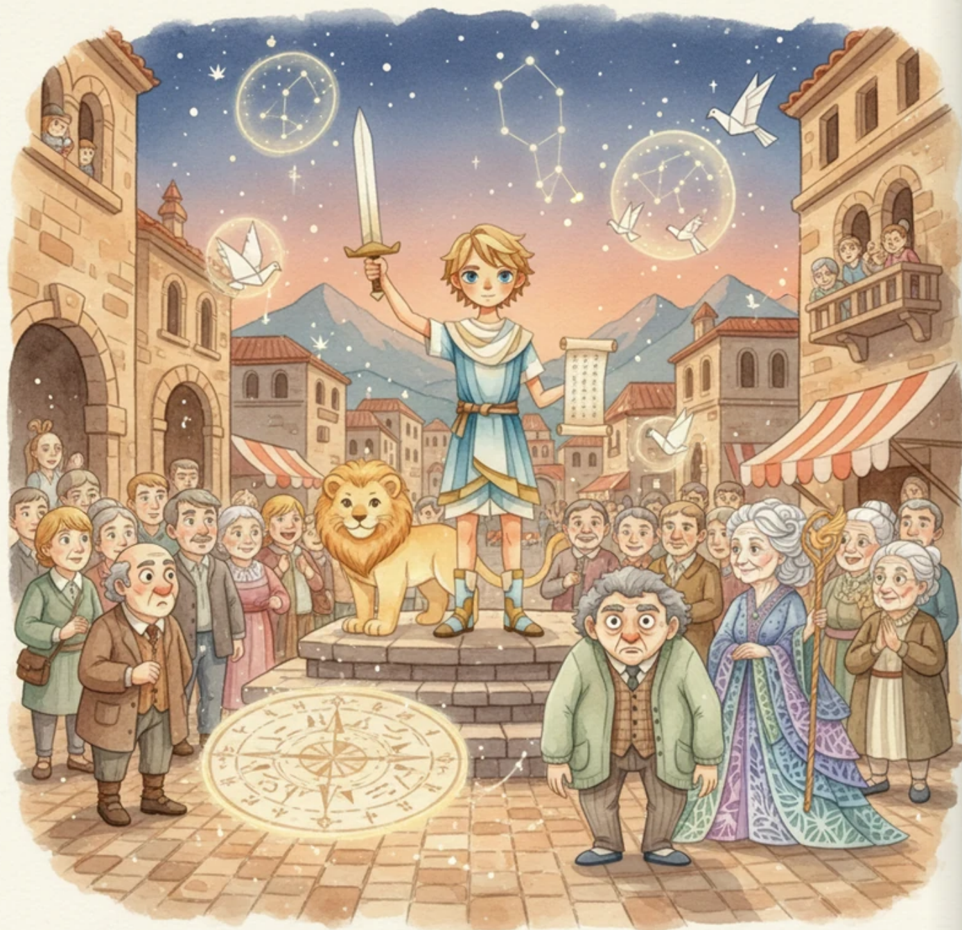
LEO – THE ORACLE’S SUCCESSOR

Tempted by the cheers of the crowd, Leo begins to perform grand, public acts of kindness just to see his shadow grow brighter. He bows and smiles for the cameras, but the Golden Brush feels heavier and colder in his grip.