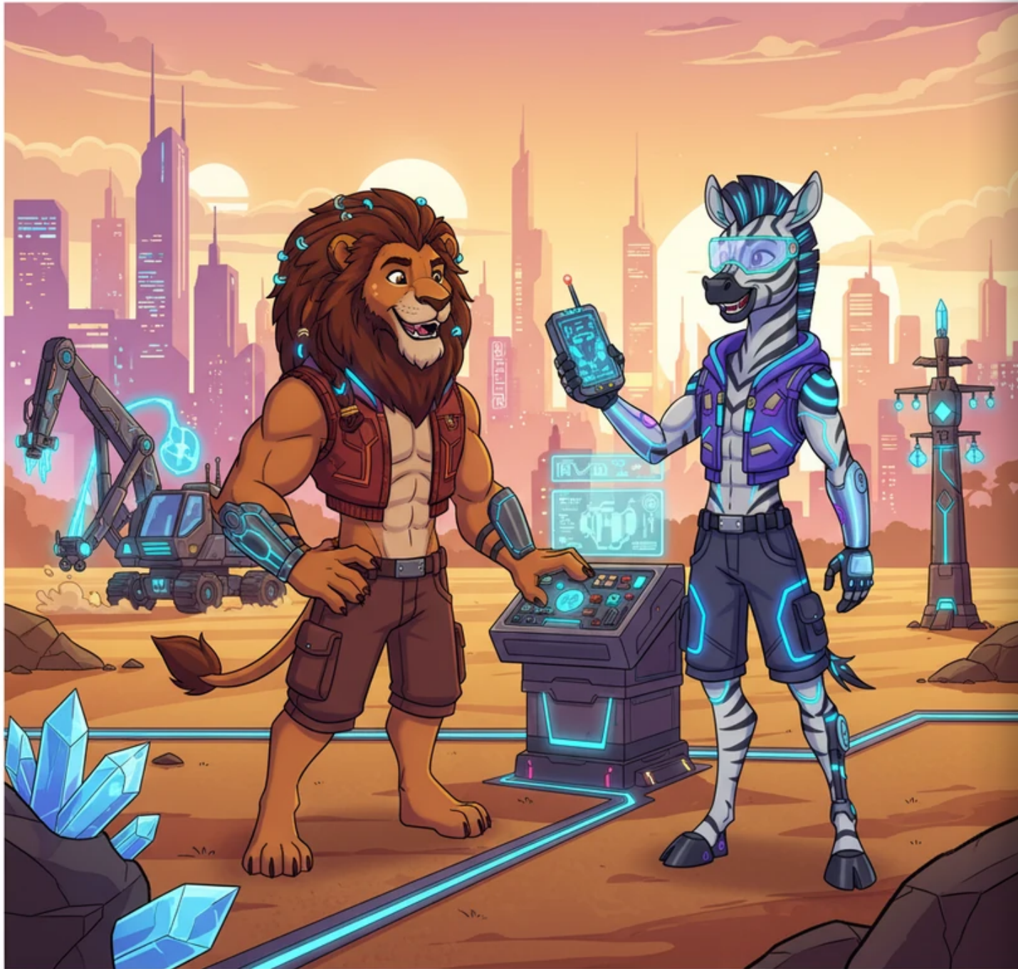
ZARA & LEO - POWERING UP THE PLAINS

Zara's eyes brightened as she kicked the ball back to Leo with a playful flick of her hooves. They began to run across the plains, passing the ball back and forth as the sun began to set.